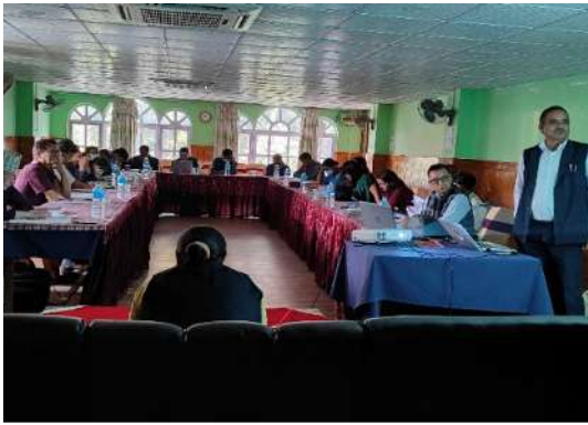
Participants discussed about the procedure of child endowment fund during session.