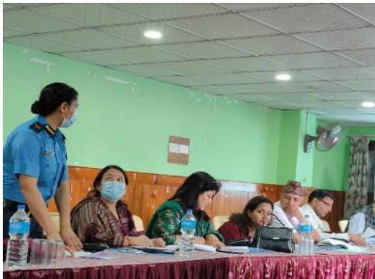
Participant from Mahila Sale of Bagmati Province raised her quarries during session